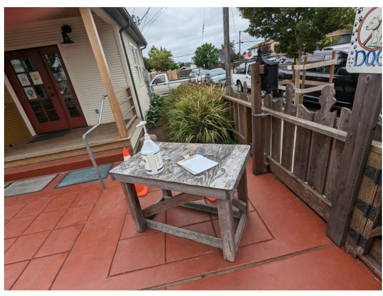
File: SUH - US trip slides part3 2023_09_08 Fehr