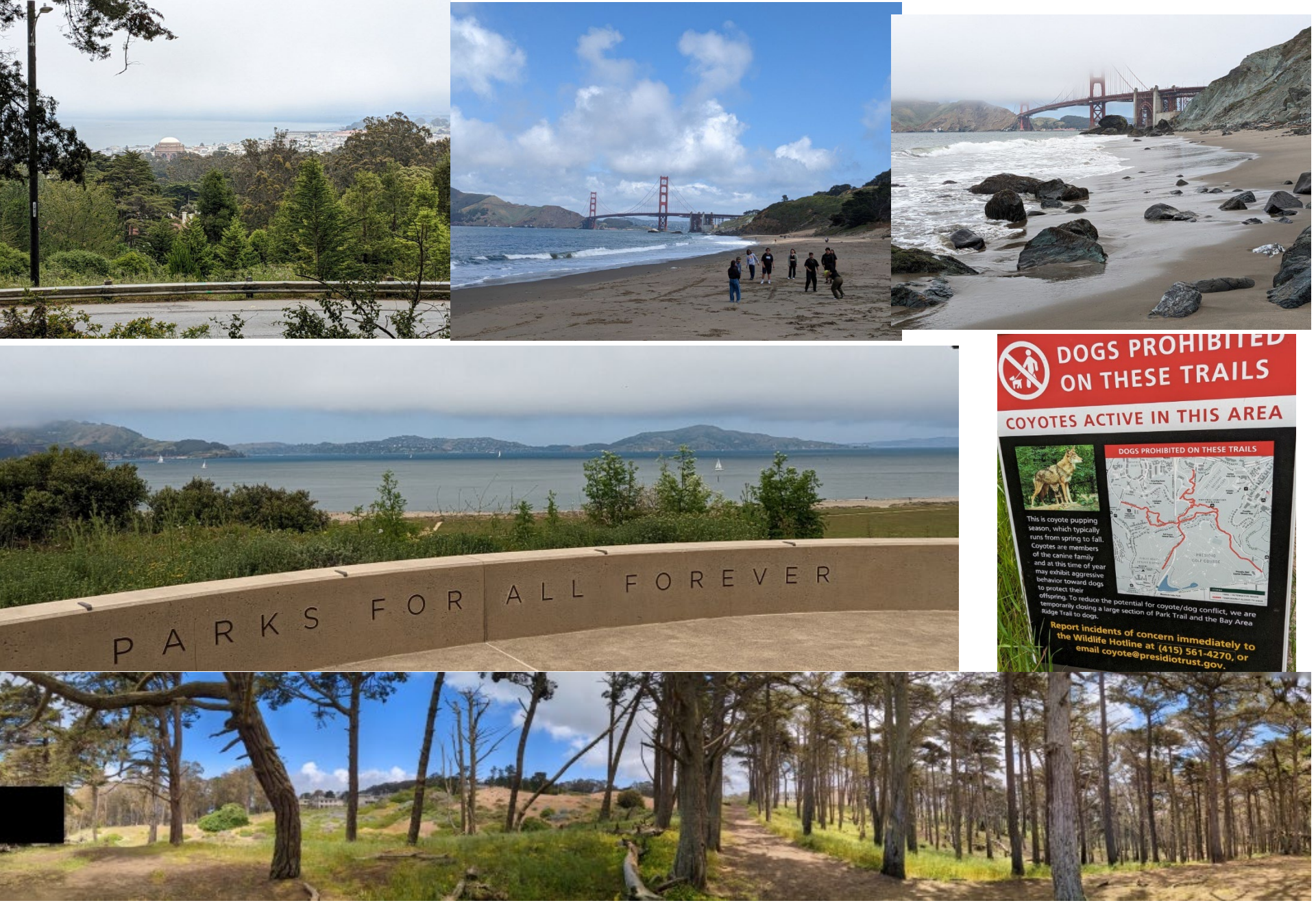
File: SUH - US trip slides part3 2023_09_08 Fehr